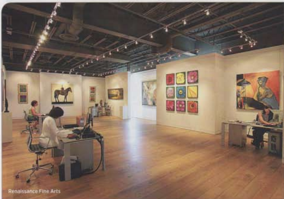
Renaissance Fine Arts